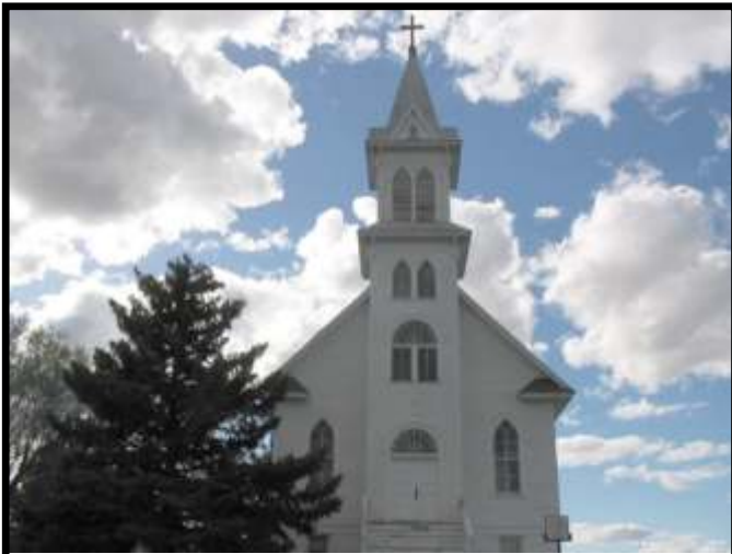
Historic Church at Douglas, Washington

United Lutheran Church is located in Waterville, Washington, a town of approximately 1,100 people. Waterville is situated on a plateau above the Columbia River in North Central Washington and at 2,622 feet is the highest incorporated city in the state of Washington. Wheat fields surround Waterville in all directions so not surprisingly there are many wheat farmers in our congregation.