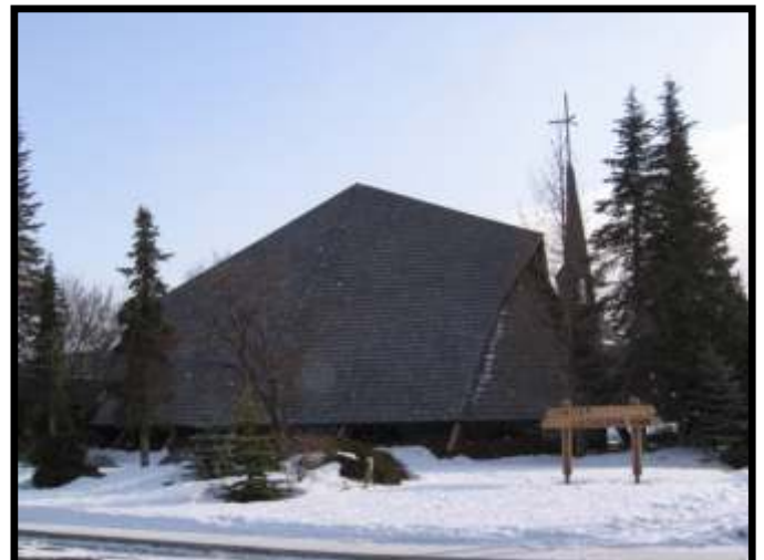
United Lutheran Church Waterville, Washington